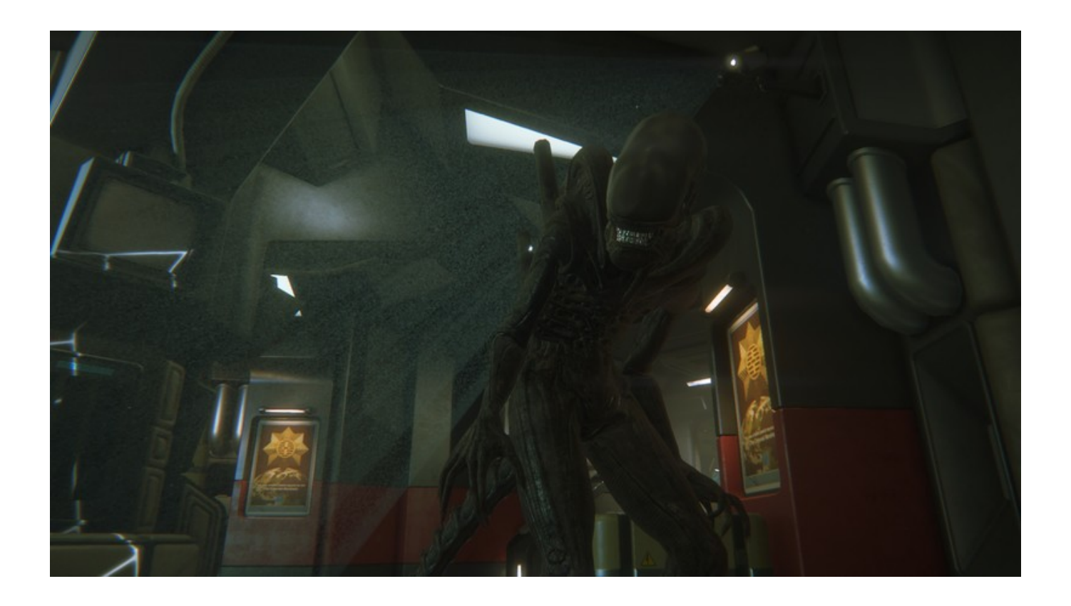
Download ->>->> http://bit.lv/2NEkbWn