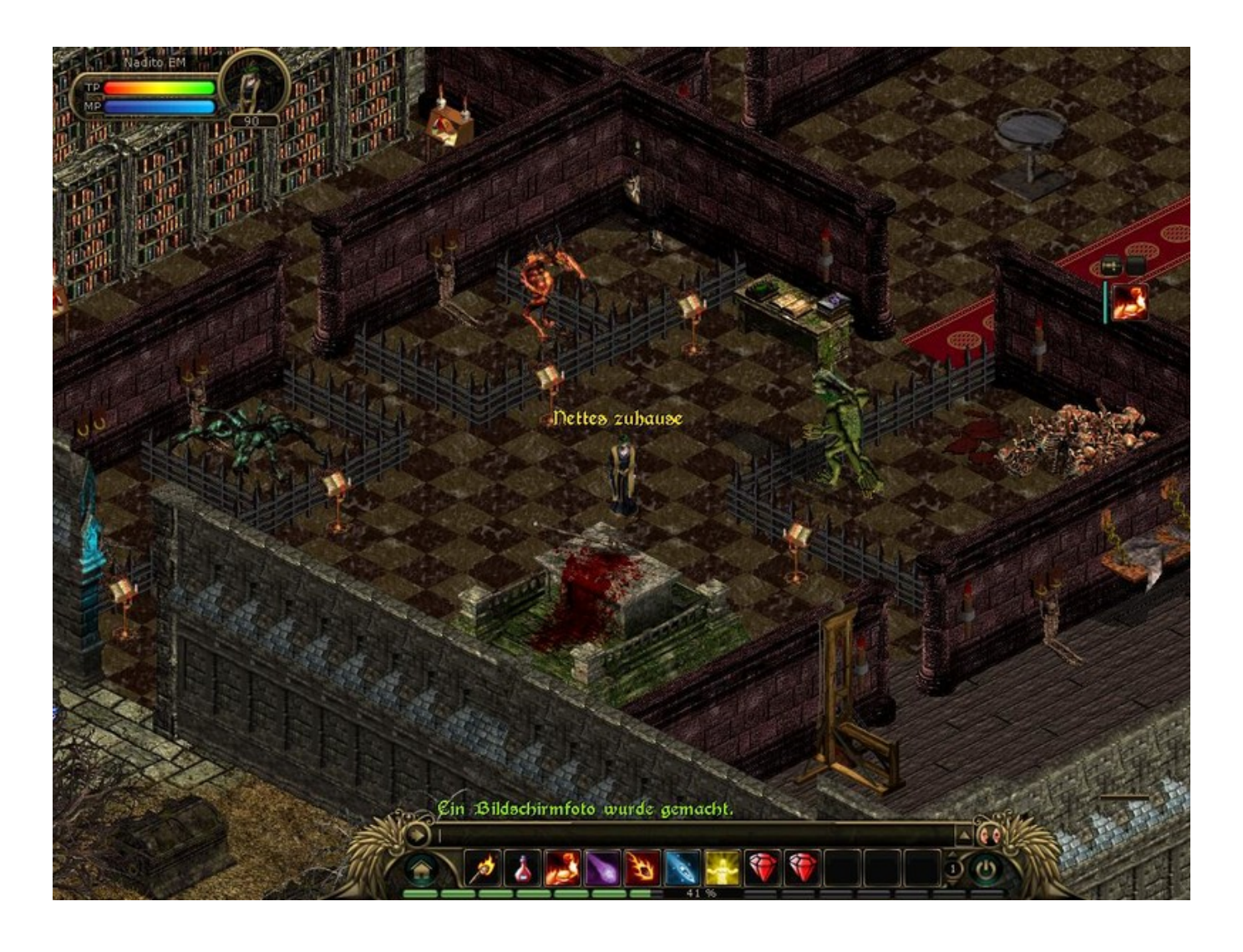
Die 4te Offenbarung Download For Pc [key Serial]